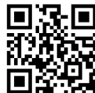
Drama Department Facebook